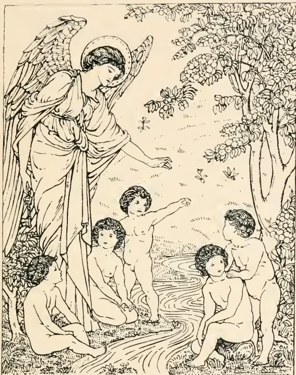
THE · CHIMNEY · SWEEPER.